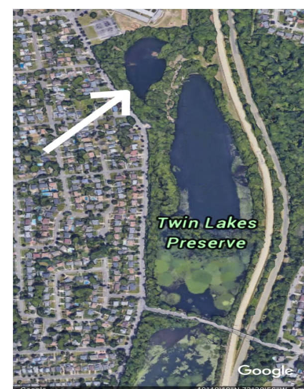
Figure 1: This is the exact location my samples were taken.

My studies were completed at the location of 40.6771° N 73.5145° W (Figure 1), in Twin Lakes Preserve on the 17th of April, 2018. I obtained my samples within an approximately twenty-foot radius from the shore where I worked. I used a net and a bucket to catch my samples by scooping up algae both above and below the surface of the water since that’s where most of the freshwater macroinvertebrates will cling to, breed on, or eat, yet to still accurately represent the results. I then sorted through the algae and put the organisms I found in miniature test tubes. I collected 22 samples of freshwater macroinvertebrates. To identify my organisms, I used a taxonification key for Freshwater Macroinvertebrates.